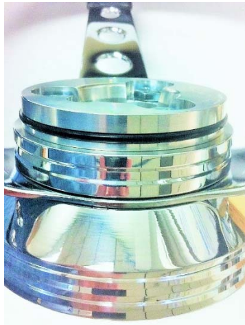
2) Riser is positioned between wheel and horn button base.