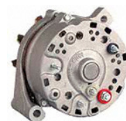
OEM Ford External Regulator 1965-86