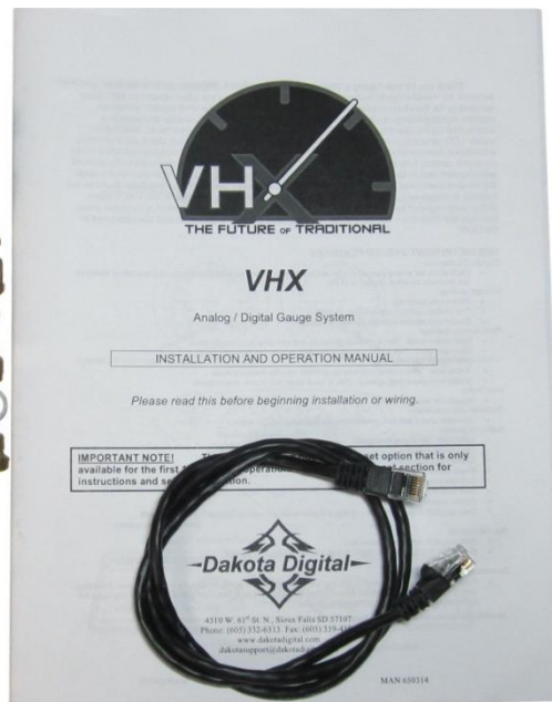
(1) 36" CAT5 Cable