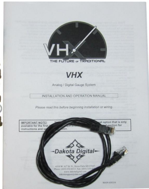
(1) 36" CAT5 Cable