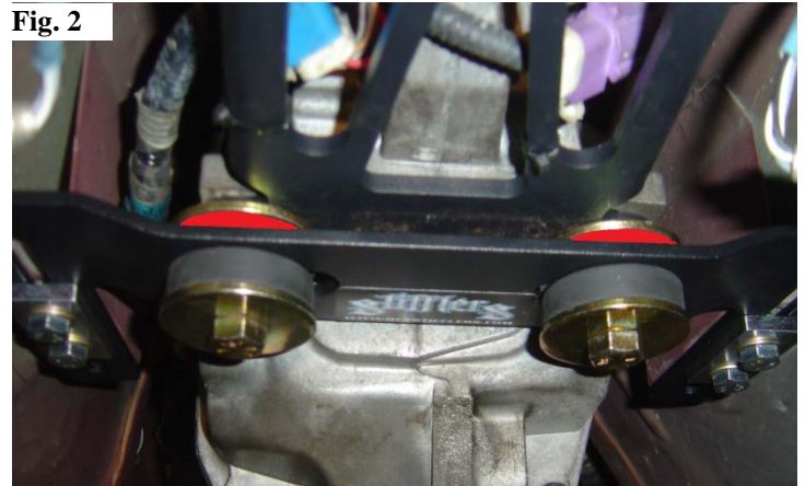
Example Install of TR-3650 with Stiffeners Loop