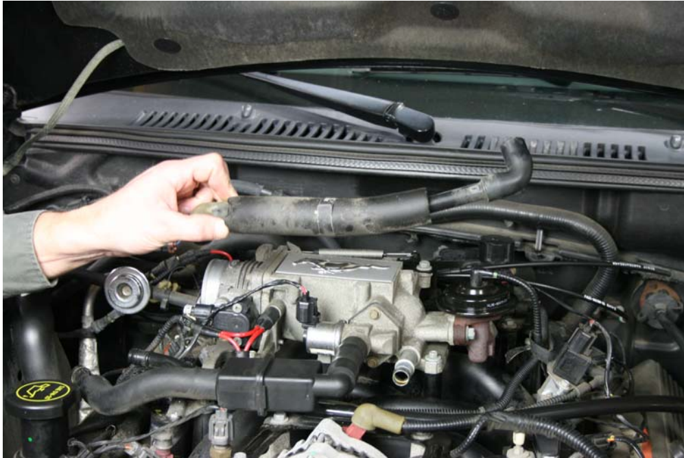
Step 9: Remove PCV tube from Vehicle and put a side