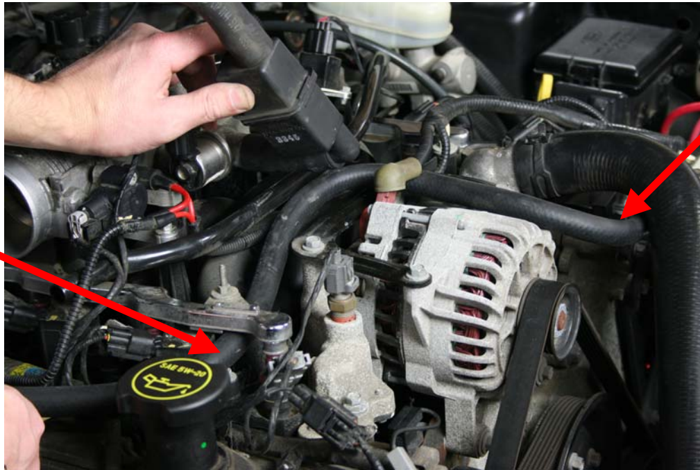
Step 16: Route ½" hose from Air Oil Separator to Valve Cover as shown