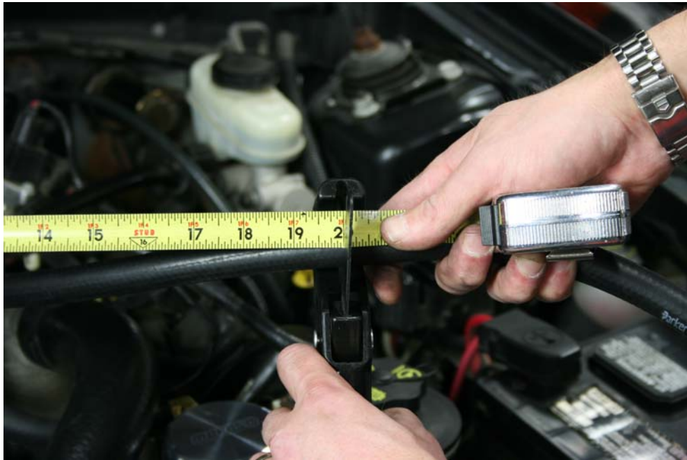
Step 20: cut 1 pc of ½” hose to 20”