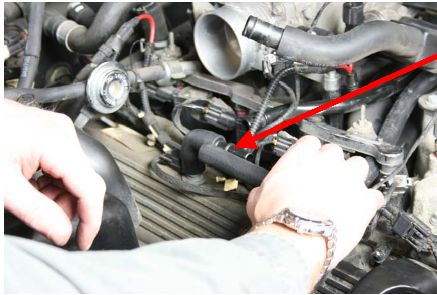
Step 18: Insert Nylon coupling into 90 degree fitting, install 90 degree fitting to PCV valve, trim 1/2" hose