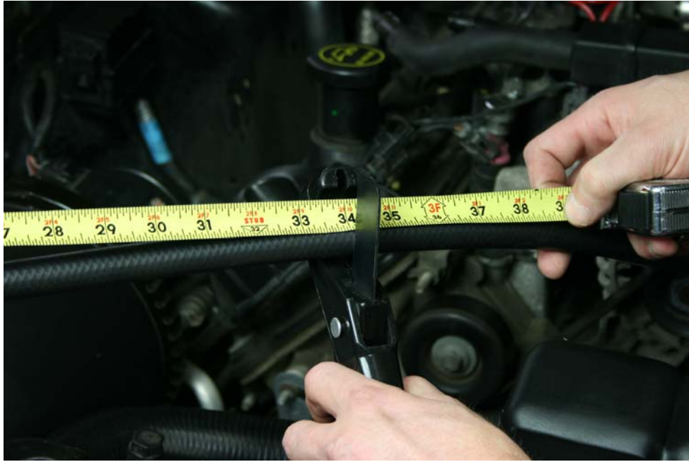
Step 14: cut 1 pc of 1/2" hose to 34"