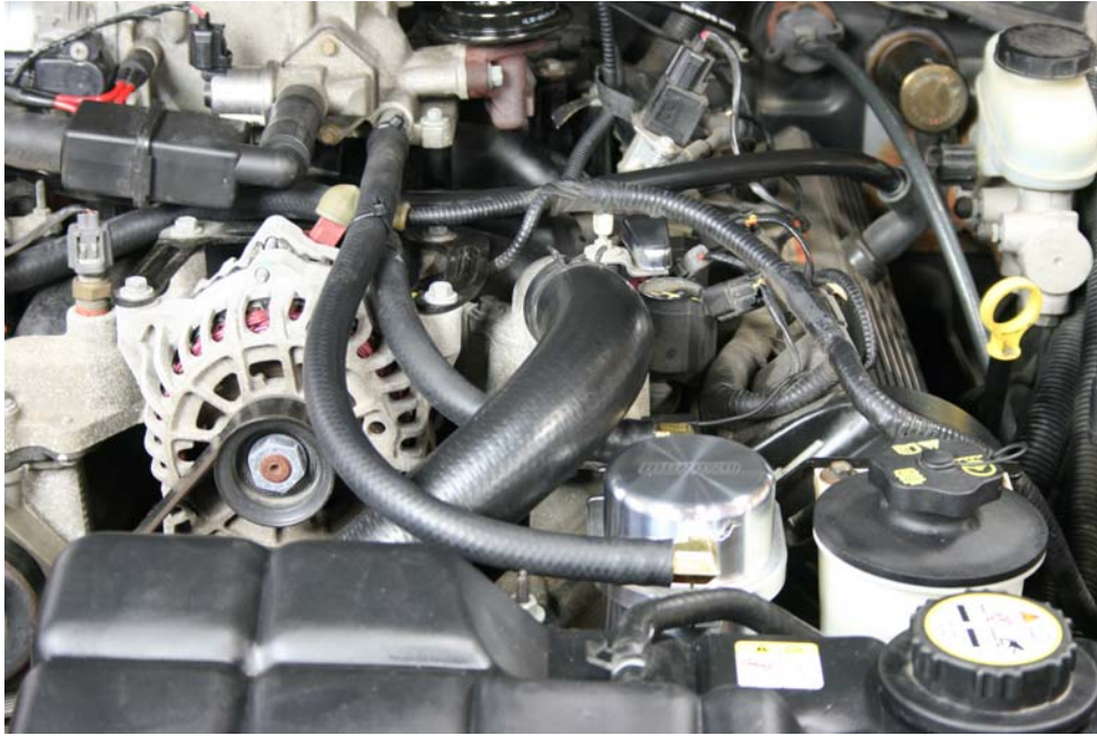
Step 26: Secure hoses with wire ties as needed