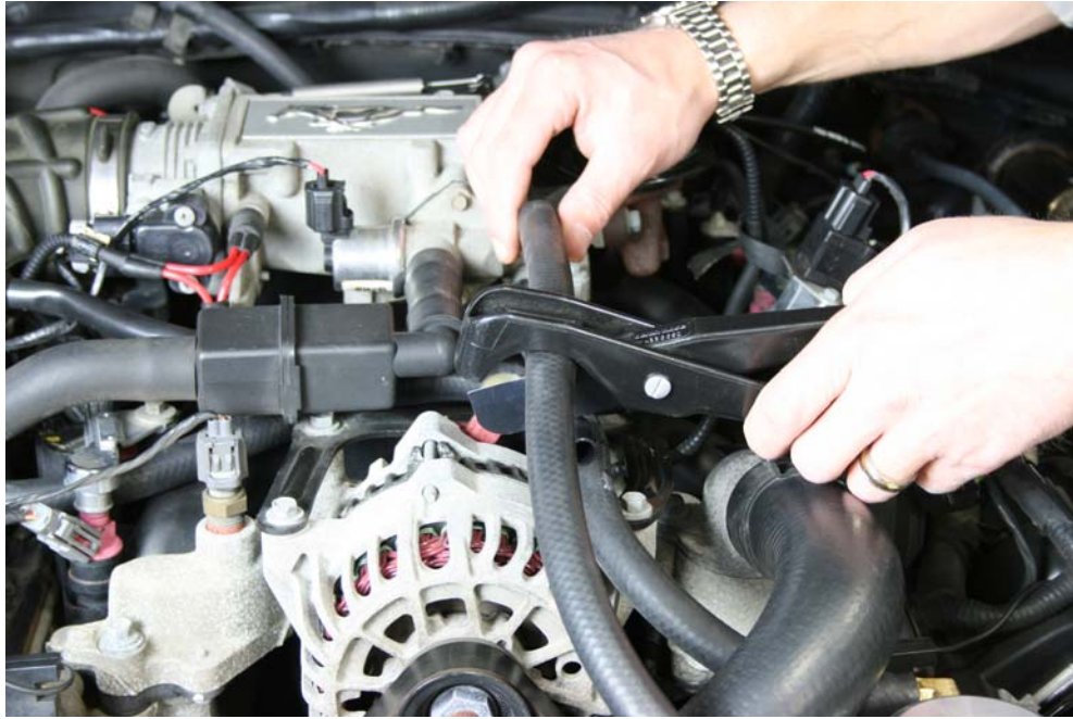
Step 24: trim 1/2" hose previously installed from step 21