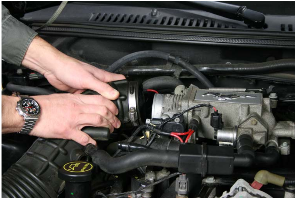
Step 3: Remove Air Intake hose from throttle body