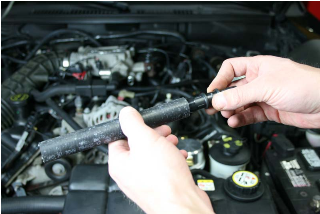
Step 22 Insert 5/8" end of coupling into 5/8" hose