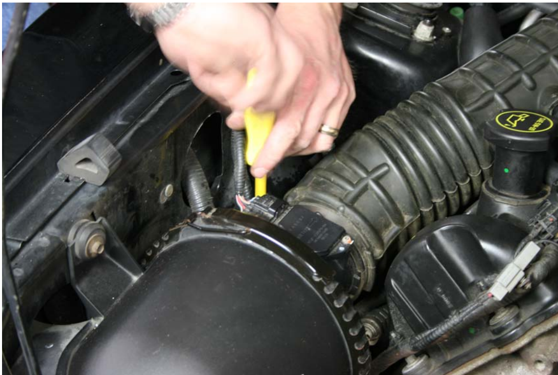
Step 31: Tighten clamp on Air Box side

For Technical Assistance, call Moroso's Tech Line (203)-458-0542, 8:30am-5:00pm Eastern Time MOROSO PERFORMANCE PRODUCTS, INC.