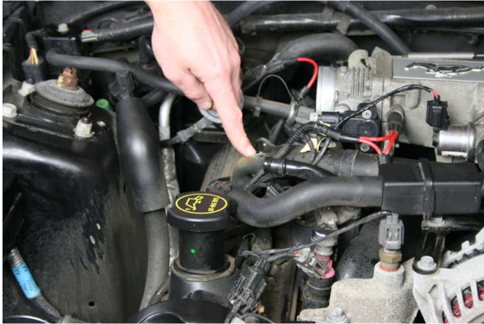
Step 5: Locate PCV Tube (Valve cover Side)