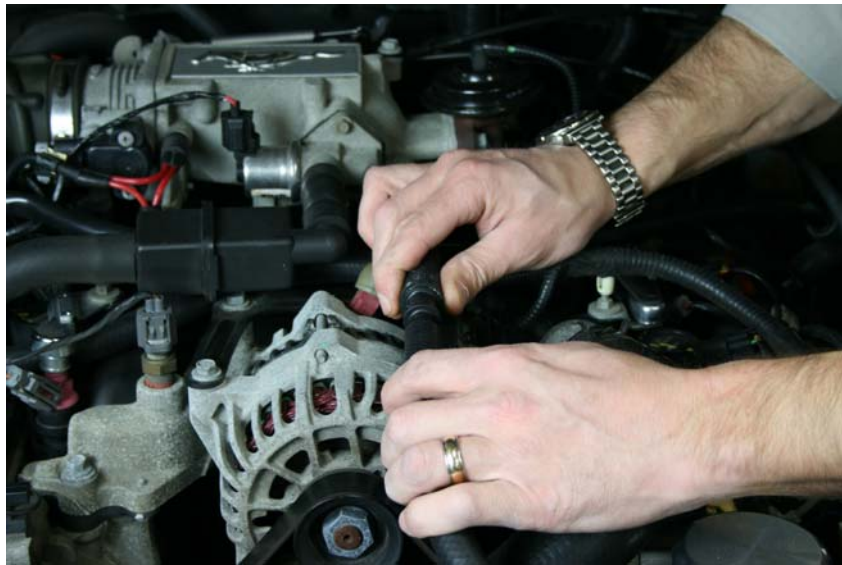
Step 25: Insert 1/2" hose over 1/2" coupling

For Technical Assistance, call Moroso's Tech Line (203)-458-0542, 8:30am-5:00pm Eastern Time MOROSO PERFORMANCE PRODUCTS, INC.