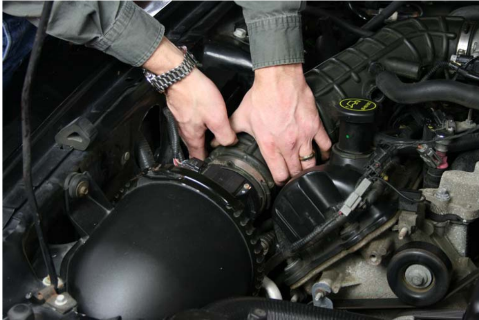
Step 28: Re-Install Air Intake hose to Air Box