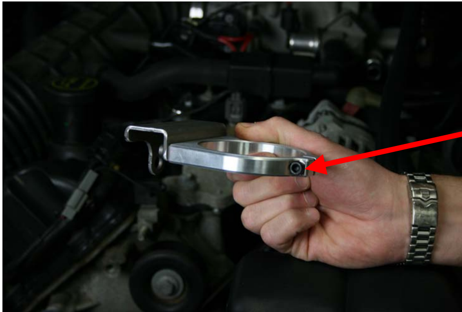
Step 10: Assemble Billet mount to Stainless Bracket as shown. Note orientation of 1/4" SHCS

For Technical Assistance, call Moroso's Tech Line (203)-458-0542, 8:30am-5:00pm Eastern Time MOROSO PERFORMANCE PRODUCTS, INC.