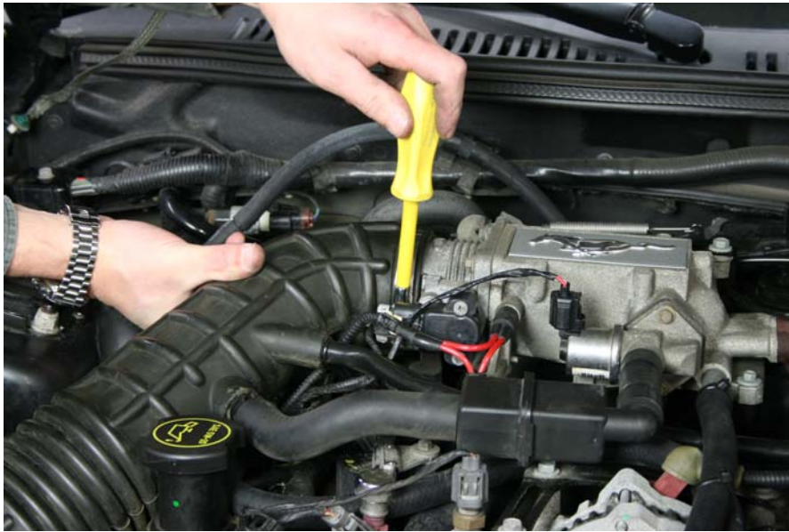
Step 30: Tighten clamp on throttle body side