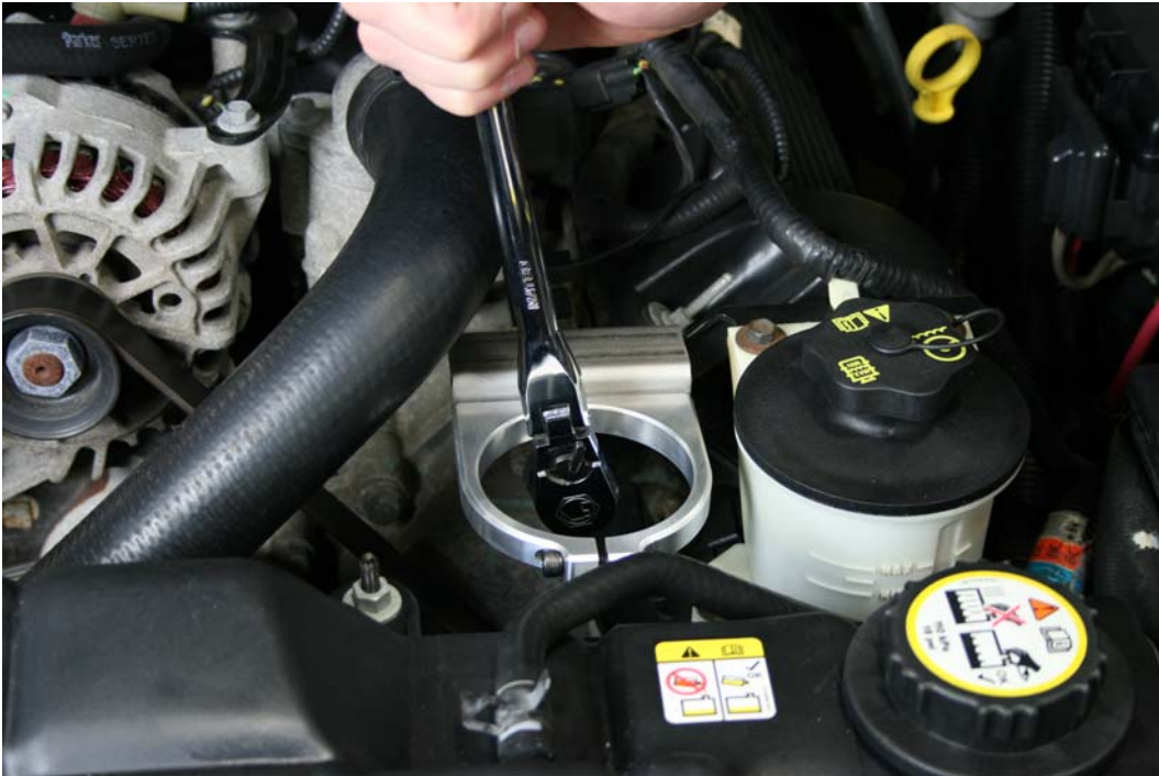
Step 1: Locate 8mm stud as shown and install Billet Stainless Mount

For Technical Assistance, call Moroso's Tech Line (203)-458-0542, 8:30am-5:00pm Eastern Time MOROSO PERFORMANCE PRODUCTS, INC.