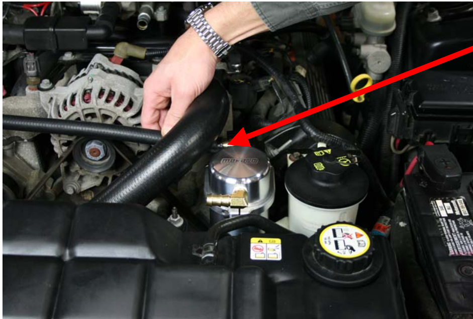
Step 15: Insert one end of 1/2" hose to rear fitting on Air Oil Separator

For Technical Assistance, call Moroso's Tech Line (203)-458-0542, 8:30am-5:00pm Eastern Time MOROSO PERFORMANCE PRODUCTS, INC.