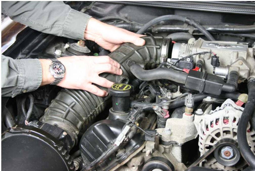
Step 27: Re-Install Air Intake hose to Throttle Body

For Technical Assistance, call Moroso's Tech Line (203)-458-0542, 8:30am-5:00pm Eastern Time MOROSO PERFORMANCE PRODUCTS, INC.