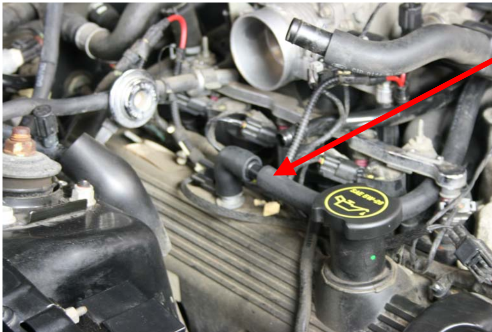
Step 19: Insert 1/2" hose over coupling

For Technical Assistance, call Moroso's Tech Line (203)-458-0542, 8:30am-5:00pm Eastern Time MOROSO PERFORMANCE PRODUCTS, INC. 80 CARTER DRIVE GUILFORD, CT 06437 www.moroso.com