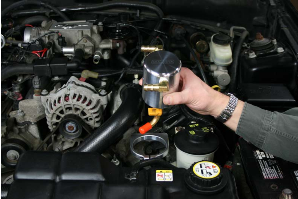
Step 12: Assemble Air Oil Separator as shown, apply Teflon Tape to all fittings