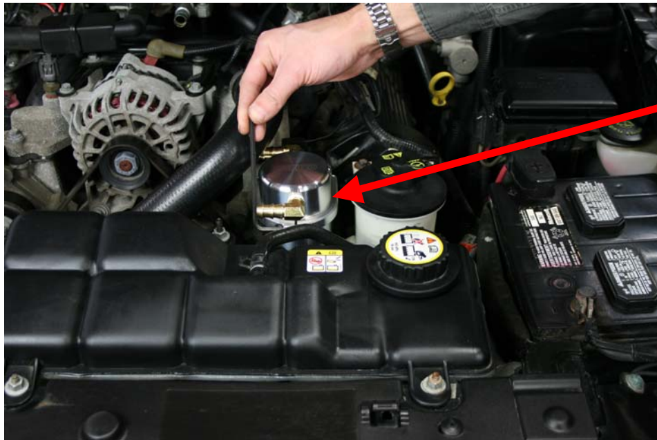
Step 13: Insert Air Oil Separator into billet clamp, line up seam on Air Oil Separator to top of Billet Clamp and tighten

For Technical Assistance, call Moroso's Tech Line (203)-458-0542, 8:30am-5:00pm Eastern Time MOROSO PERFORMANCE PRODUCTS, INC.