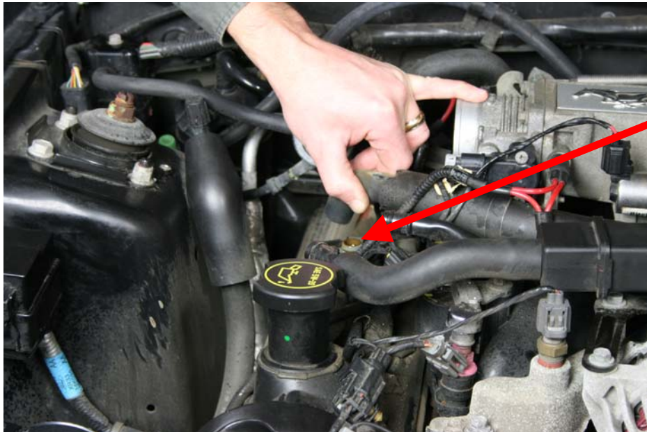
Step 6: Remove tube from PCV Valve

For Technical Assistance, call Moroso's Tech Line (203)-458-0542, 8:30am-5:00pm Eastern Time MOROSO PERFORMANCE PRODUCTS, INC.