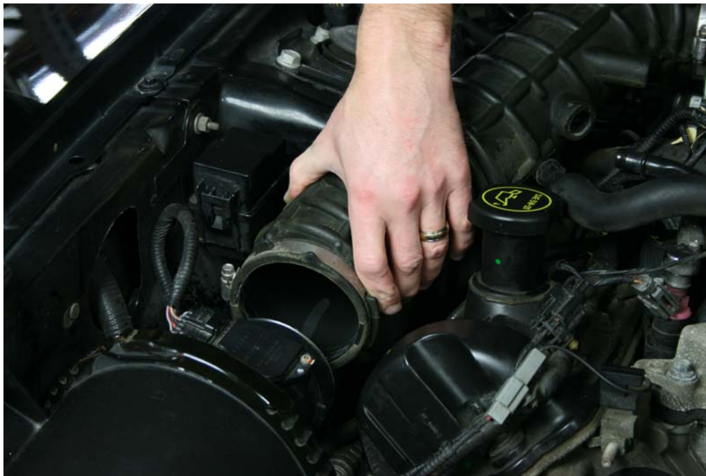
Step 4: Remove Air Intake hose from Air Cleaner Box, and remove from vehicle

For Technical Assistance, call Moroso's Tech Line (203)-458-0542, 8:30am-5:00pm Eastern Time MOROSO PERFORMANCE PRODUCTS, INC.