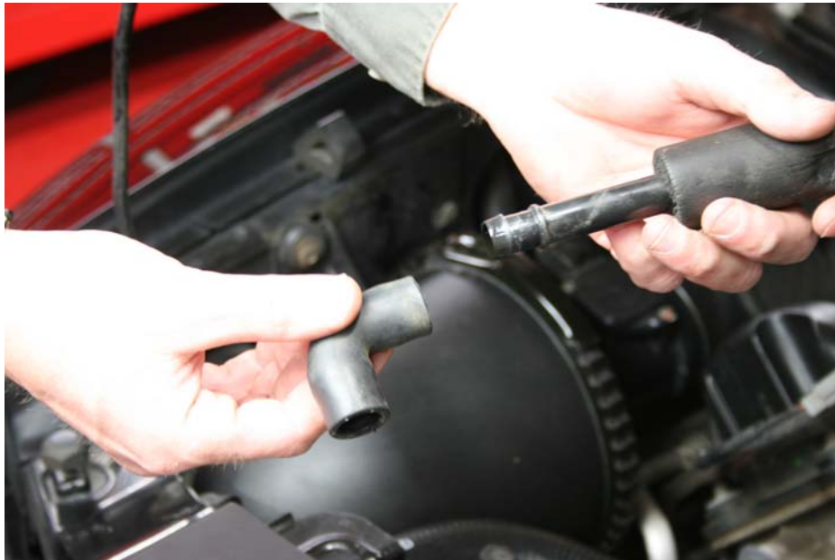
Step 17: Remove 90 degree fitting from PCV tube previously removed

For Technical Assistance, call Moroso's Tech Line (203)-458-0542, 8:30am-5:00pm Eastern Time MOROSO PERFORMANCE PRODUCTS, INC.