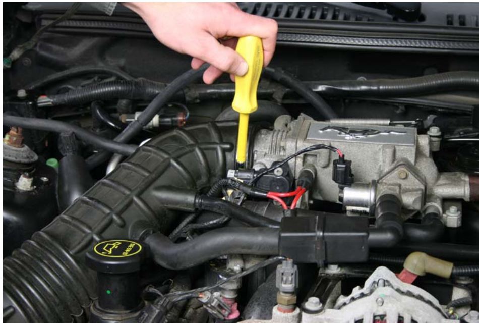
Step 1: Loosen Air Intake hose clamps

For Technical Assistance, call Moroso's Tech Line (203)-458-0542, 8:30am-5:00pm Eastern Time MOROSO PERFORMANCE PRODUCTS, INC.