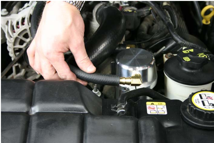
Step 21: Insert one end of ½” hose to front fitting on Air Oil Separator

For Technical Assistance, call Moroso's Tech Line (203)-458-0542, 8:30am-5:00pm Eastern Time MOROSO PERFORMANCE PRODUCTS, INC.