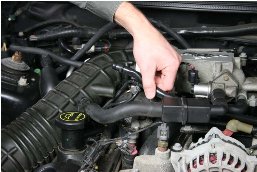
Step 2: Remove lines from Air Intake hose

For Technical Assistance, call Moroso's Tech Line (203)-458-0542, 8:30am-5:00pm Eastern Time MOROSO PERFORMANCE PRODUCTS, INC.