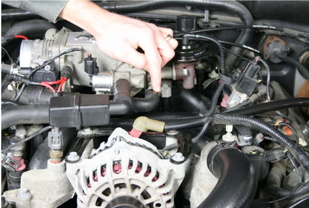
Step 7: Locate PCV Tube (Intake Side)