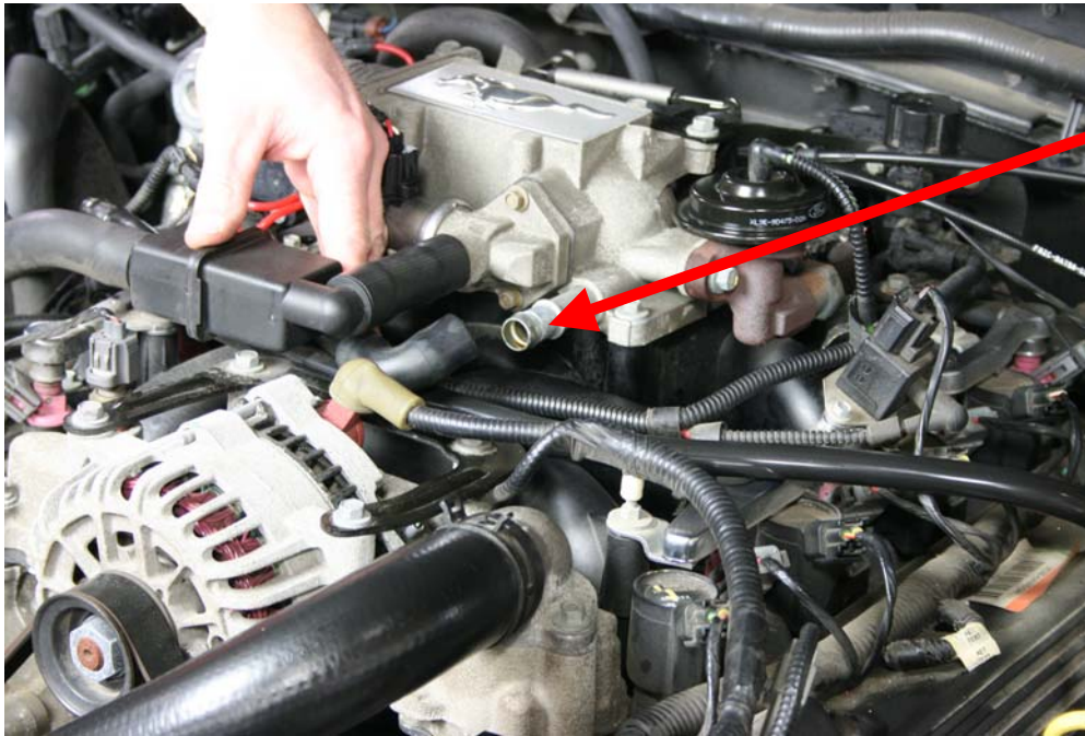
Step 8: Remove from Intake

For Technical Assistance, call Moroso's Tech Line (203)-458-0542, 8:30am-5:00pm Eastern Time MOROSO PERFORMANCE PRODUCTS, INC.