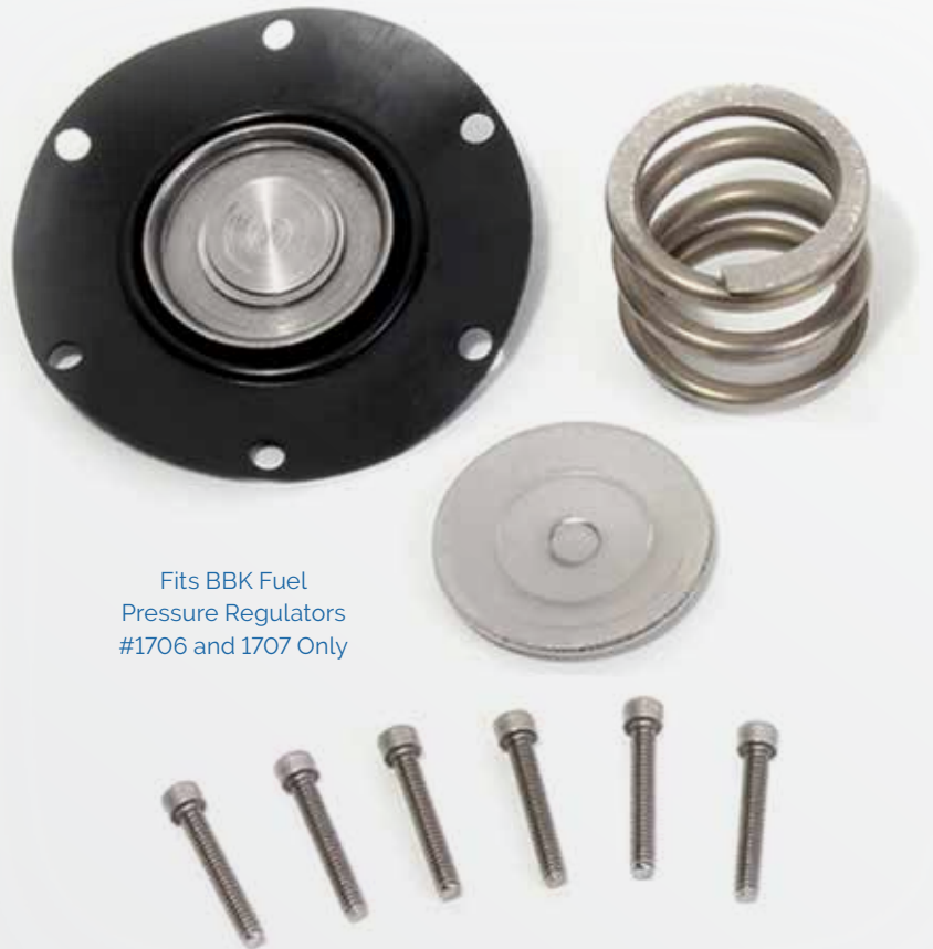
Fits BBK Fuel Pressure Regulators #1706 and 1707 Only